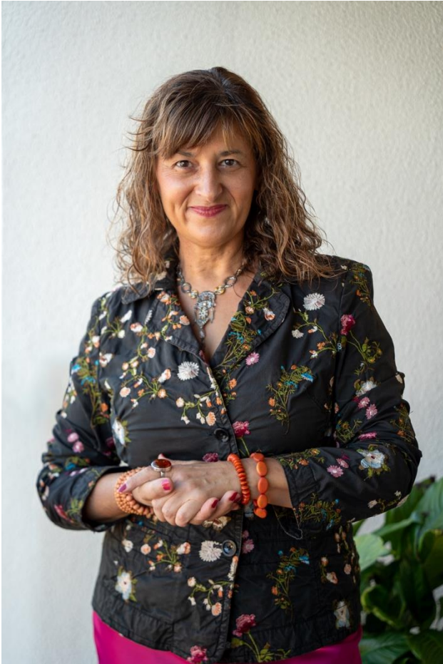
Shemewé Collective, Principal, Practitioner & Facilitator